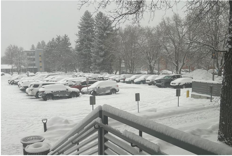
MSU Bozeman, MT on January 24 th , 2025